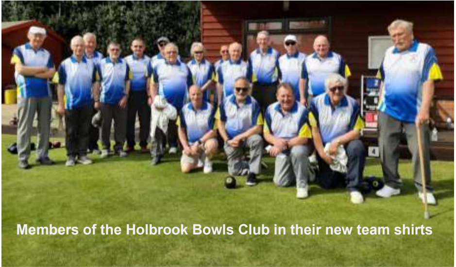
Members of the Holbrook Bowls Club in their new team shirts